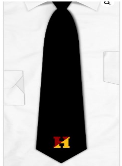
Black with yellow and red H