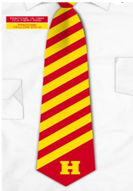
Red and Gold with a yellow H