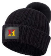
STYLE: POM BEANIE

gifting a beanie | fighting cancer | supporting the Fords