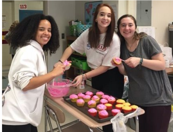
Fords for A Cure volunteers