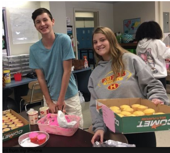
Volunteers icing the pink cupcakes