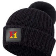
STYLE: POM BEANIE

gifting a beanie | fighting cancer | supporting the Fords