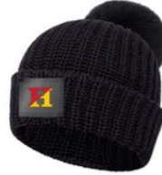
STYLE: POM BEANIE

love ♥ YOUR melon gifting a beanie | fighting cancer | supporting the Fords