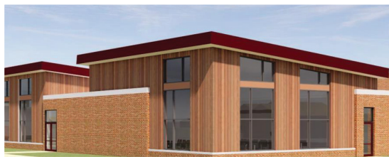
Architect's rendering: 1 story classroom wing, exterior perspective

Update: The new wing was opened and occupied in fall 2021. Parking spaces were also completed for fall 2021.