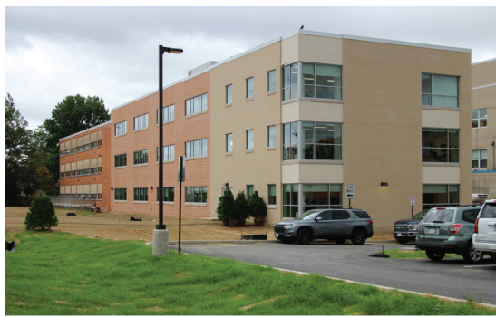
New wing of Haverford High School

This new wing will accommodate enrollment growth and provide updated educational spaces to meet our students' academic, social, and physical needs. The projects were implemented over two years to phase in the payments and safely monitor construction while school was in session. The plan adds 29,560 square feet of instructional space to the high school, which will accommodate expected future growth in student enrollment. This was developed and approved to take place in two phases: