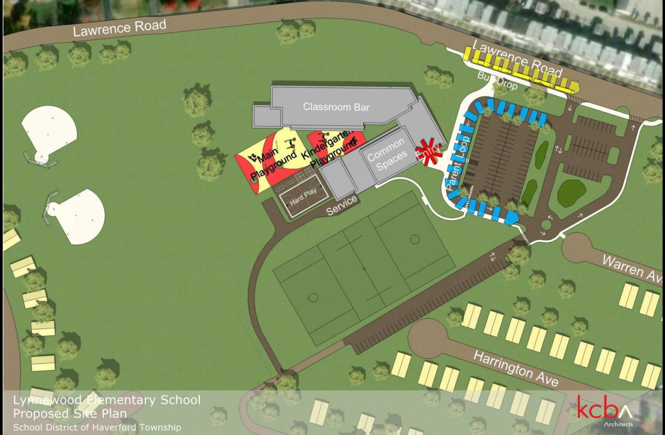
Lynnewood Elementary School Proposed Site Plan School District of Haverford Township