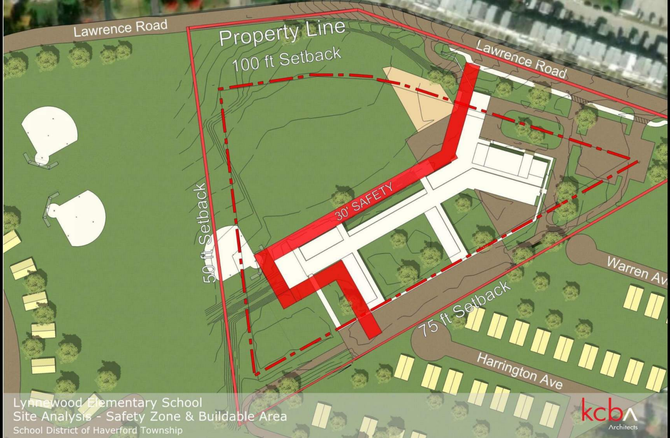
Lynnewood Elementary School Site Analysis - Safety Zone & Buildable Area School District of Haverford Township