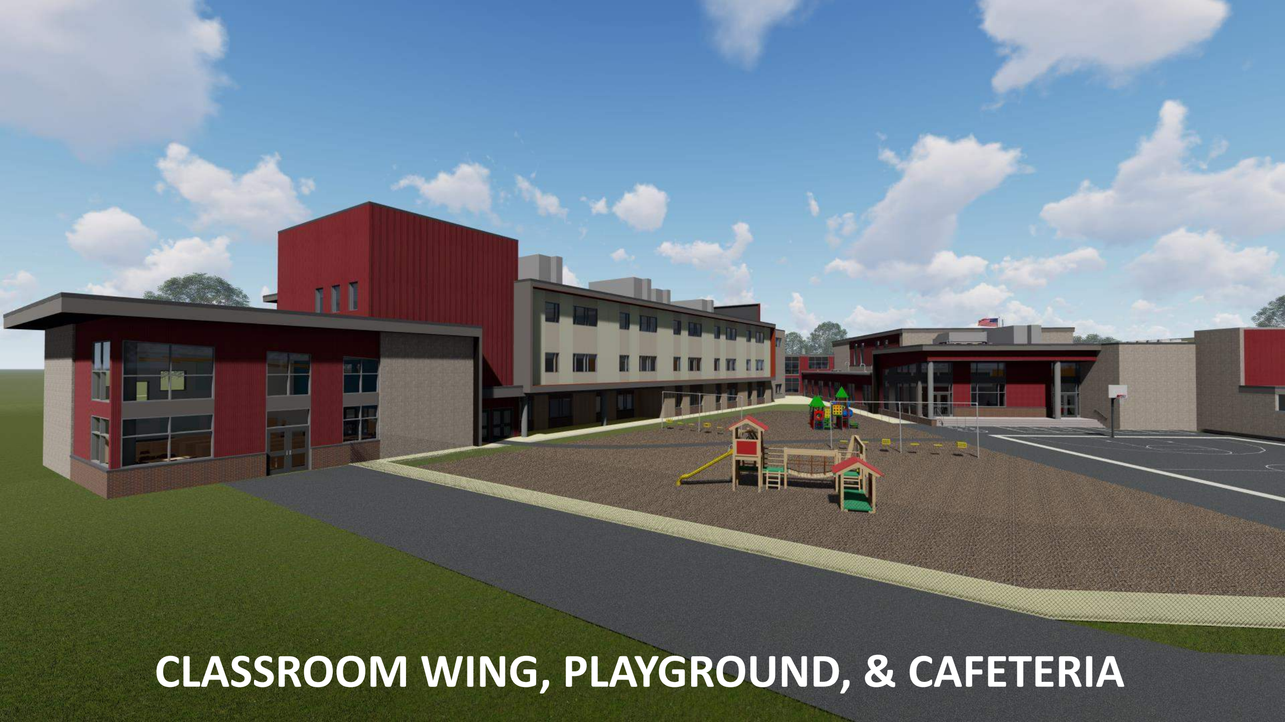
CLASSROOM WING, PLAYGROUND, & CAFETERIA