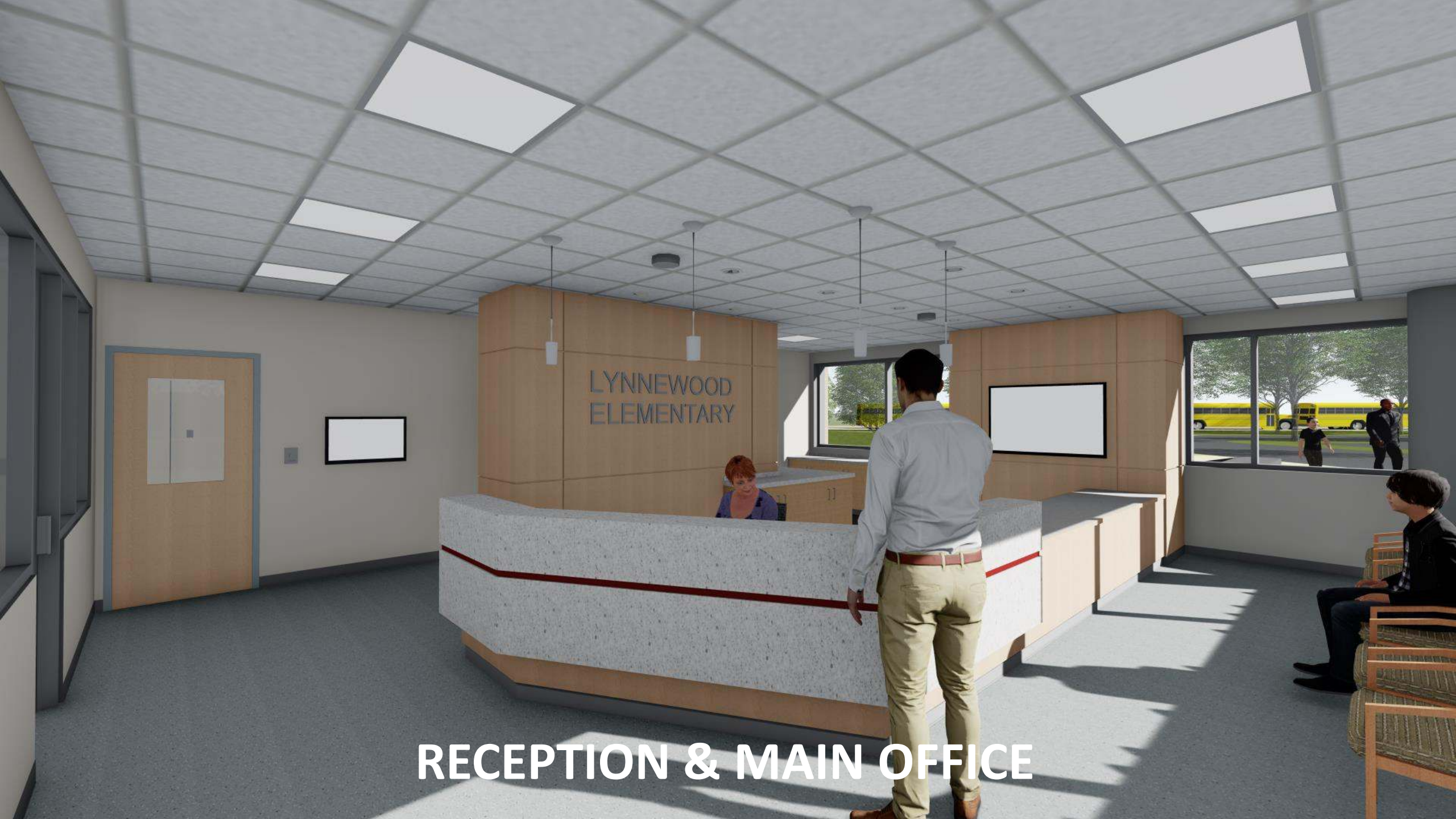
RECEPTION & MAIN OFFICE