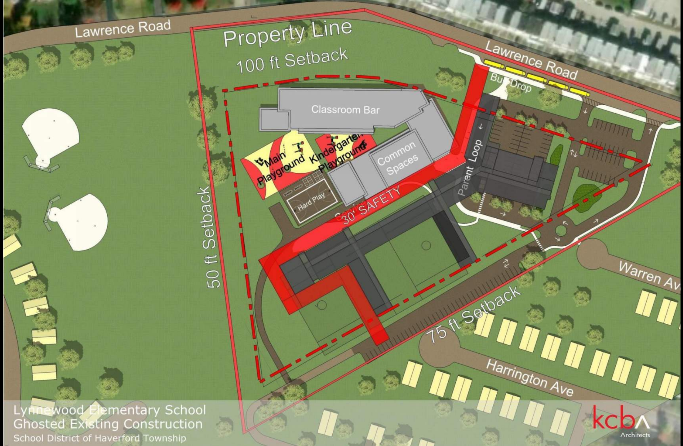
Lynnewood Elementary School Ghosted Existing Construction School District of Haverford Township