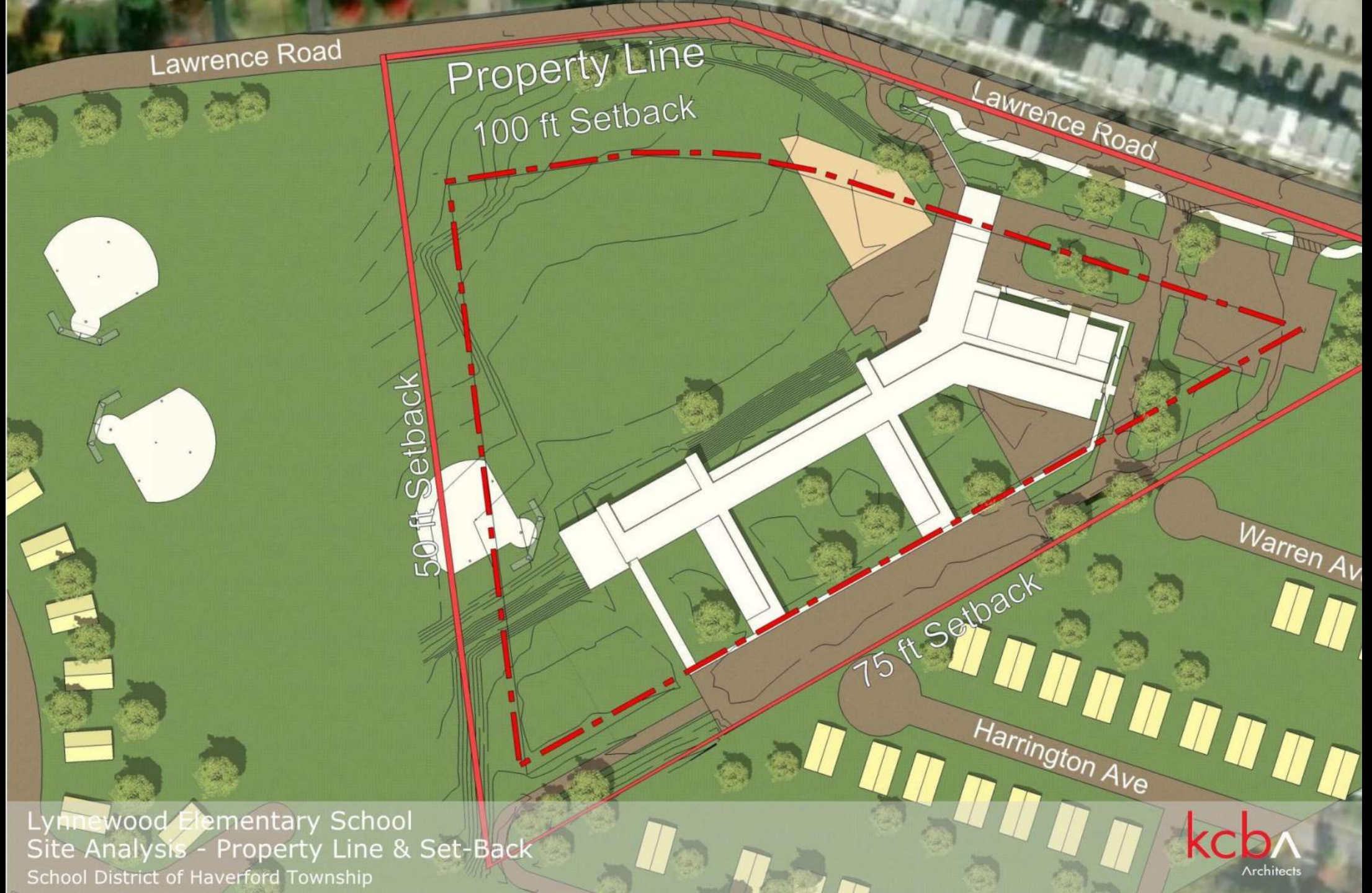
Lynnewood Elementary School Site Analysis - Property Line & Set-Back School District of Haverford Township