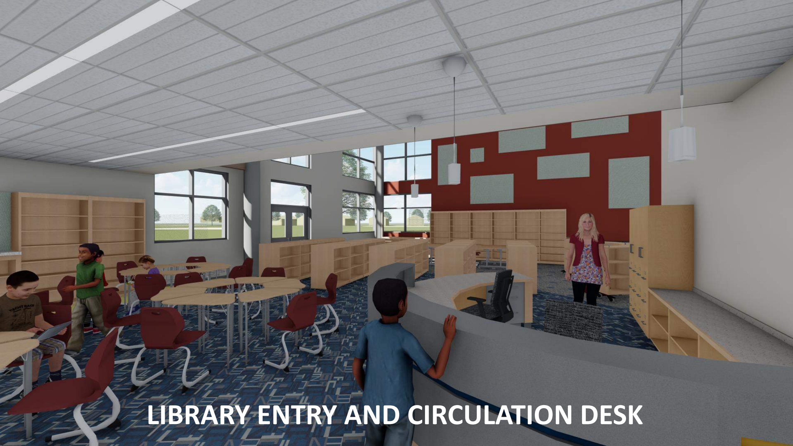
LIBRARY ENTRY AND CIRCULATION DESK