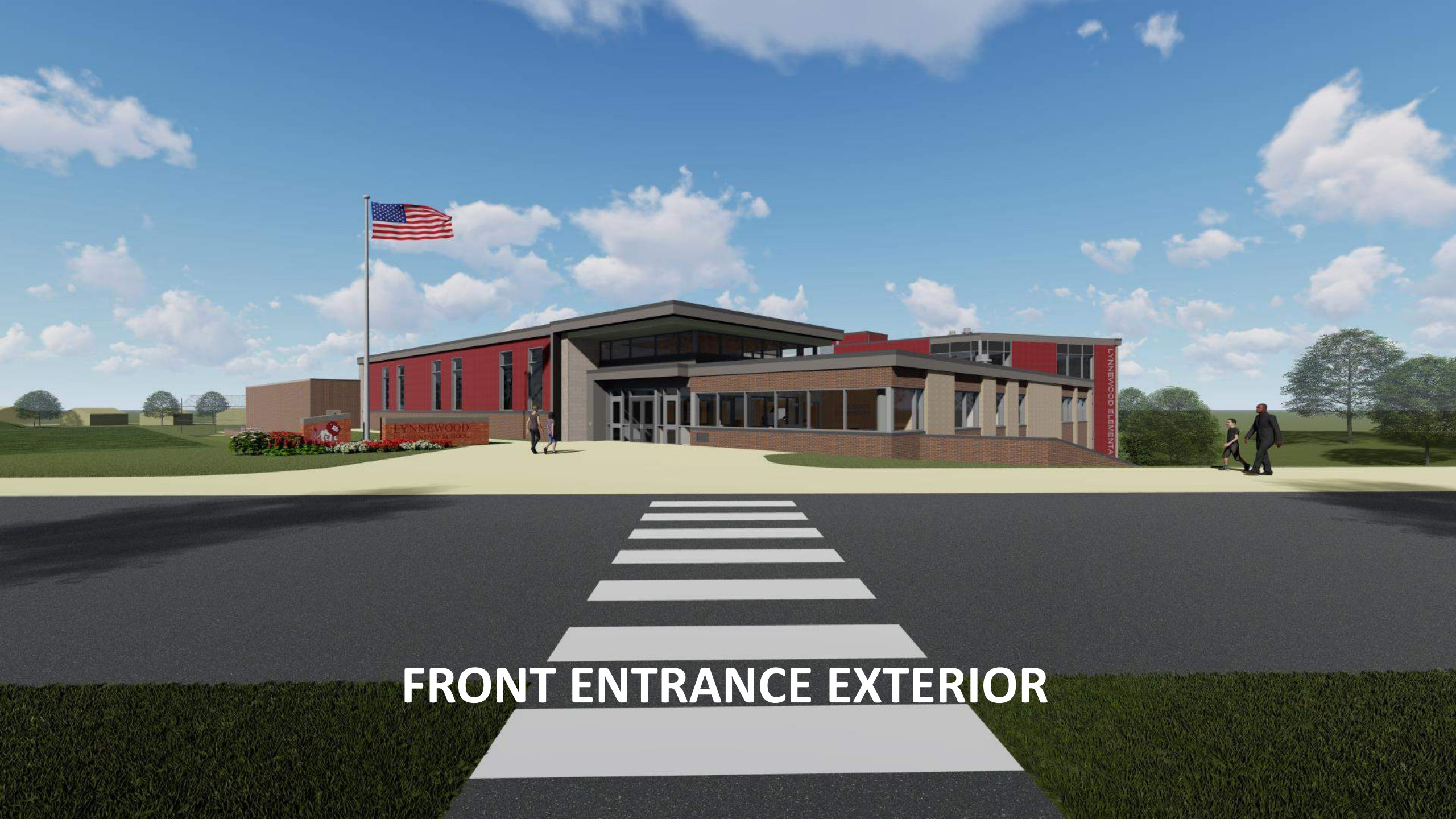
FRONT ENTRANCE EXTERIOR