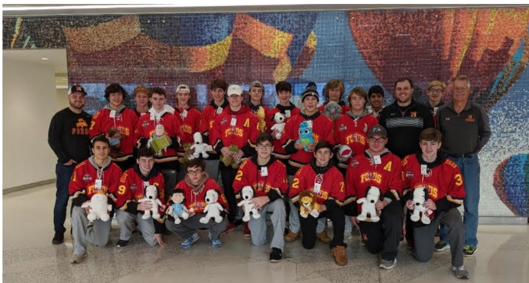
Ice Hockey team visits St. Christopher's to bring stuffed animals to patients

Congratulations! Haverford Ice Hockey beats Garnett Valley 8 to 2...still undefeated in the Central League! Go FORDS!